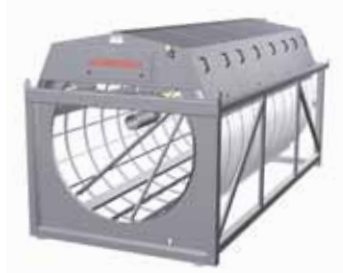
Type 2H, Open inlet