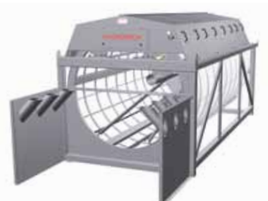
Type 2, Wing walls