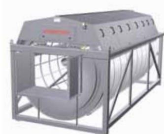
Type 2F, Open inlet (incl. connection for inlet channel)