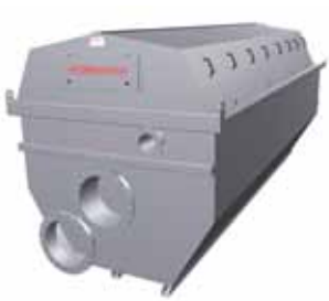
Type 1, Tank

The Hydrotech Drumfilter is available in two drive system versions; direct drive and chain transmission. The direct drive is used on the two smallest drum sizes with 0.5 and 0.8 m drum diameter. On the chain transmission, Hydrotech has an option to deliver with maintenance free plastic chains.