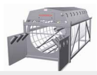
Type 2, Wing walls