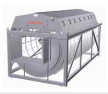
Type 2F, Open inlet (incl. connection for inlet channel)