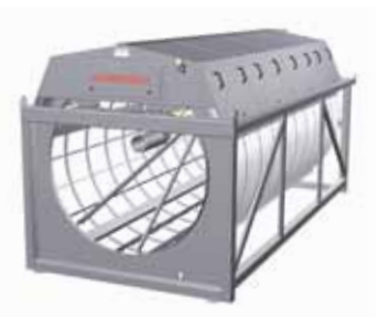
Type 2H, Open inlet